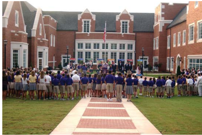
The entire Middle School student body and faculty gather in the amphitheater for the Ribbon Cutting.