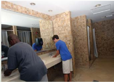
Resident students check out the new facility in Summerbell House.